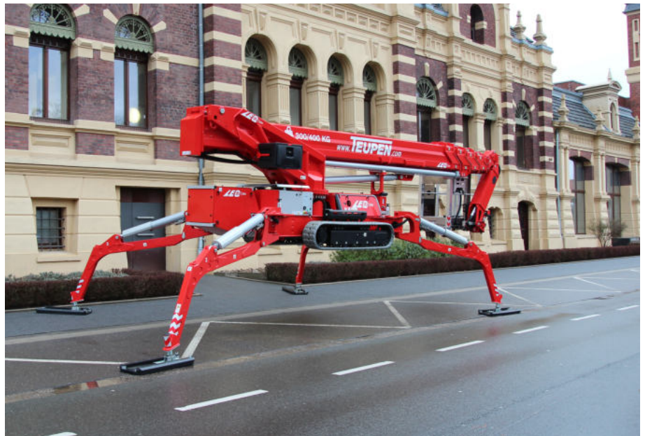
Three different set up positions: Both side wide, both side narrow, one side narrow