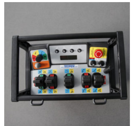
User-friendly radio remote control with colour coded functions