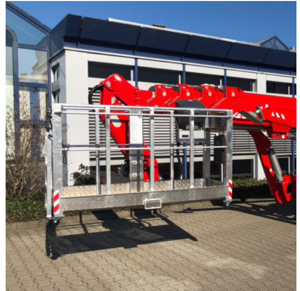
Four different platform sizes available: 900x800 mm, 1200x800 mm, 1500x800 mm, 2000x800 mm