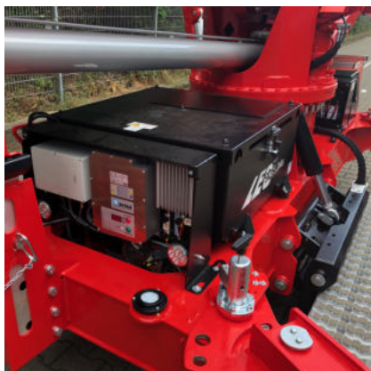
Diesel engine as standard - battery drive optional selectable